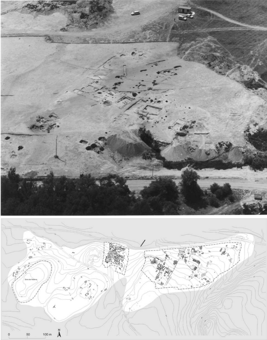
Figure 3. Aerial view and map of the early medieval site of Gózquez (Madrid), by kind permission of Alfonso Vigil-Escalera.

collection processes. Fieldwork undertaken by contract professionals often has no explicit aims for research – not even for producing scholarly publications – and it is, of course, carried out wherever need comes up, regardless of research priority areas or subjects. On the opposite side, medieval archaeology is still crudely under-represented in academic institutions. Wherever significant groups of archaeologists have joined the academy, relevant advances are obtained, but the situation is most uneven. Let us take three cases. First, the Madrid region, where the recent building and development frenzy