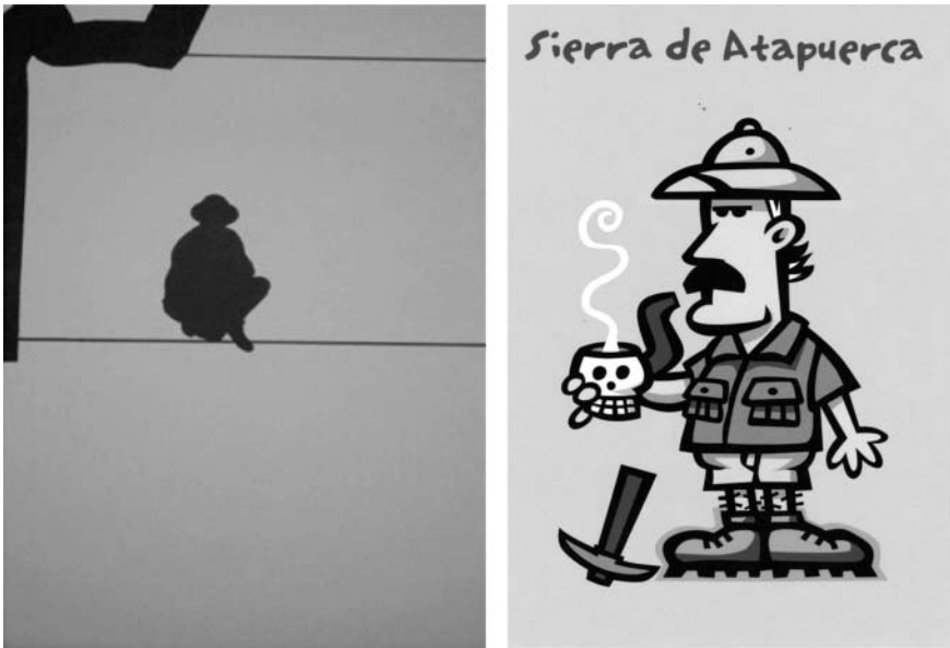
Figure 1. Eudald Carbonell has become an icon – and appears as a silhouette (left) on the walls of the Museo de la Evolución Humana in Burgos, or on postcards (right). Photo: Oliver Hochadel, Postcard: SierrActiva.

In this description Eudald Carbonell appears like a character out of a Hollywood movie. His distinctive features lend themselves to iconographic use. The man with the moustache and the sun-helmet smoking a pipe is a recurring item in the corporate image of the EIA ( Equipo de Investigación de Atapuerca ), at times only as a silhouette. He appears as the archetype of an archaeologist.