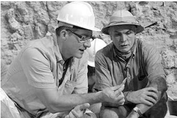
Figure 4. Eudald Carbonell with Fermí Fernández, presenter of the archaeology reality TV-show Sota Terra , 2010.

This logic requires for example that information needs to be presented in an entertaining way. This is nicely illustrated by the archaeology reality TV-show called Sota Terra ( Under the earth ) broadcast by the Catalan television channel TV3 in 2010 and 2012 82 . A team of archaeologists has three days to carry out an excavation at a specific site, for example a Roman house in Barcelona or a battlefield from the Civil War in the Ebro delta. TV3 contracted Eudald Carbonell to play the part of the expert archaeologist. In one of the episodes a local radio station interviews Carbonell. The host of the radio show asks him whether he likes being called a «media archaeologist». Carbonell responds: the more mediatic the better because this contributes to socializing knowledge about human evolution 83 .