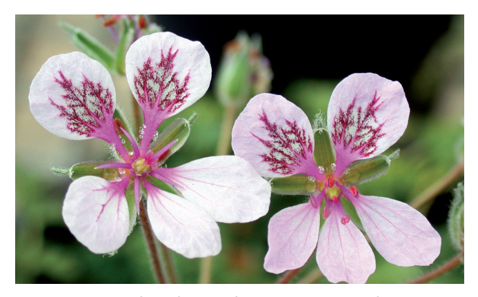
Fig. 1. Close view of two flowers of Erodium cazorlanum from the same inflorescence illustrating the morphological changes associated to floral ontogeny and protandry. Initially, during male phase (right flower) stigmatic lobes are closed, stamens are straight and anthers dehisce to offer pollen, note the two already dehisced anthers showing abundant red pollen. After, during female phase (left flower) the five receptive stigmatic lobes open in a star like shape, the stamens draw back and eventually anthers fall down, note that only one anther remains attached to the filament. Those changes functionally reduce the possibility of autonomous selfing but asynchrony among flowers allows geitonogamy.

a stamen with forceps and brushing the dehisced anther directly onto the stigma until all five lobes were thoroughly coated with pollen, as easily observed with magnifying glasses. In the vast majority of cases anthers were detached from the flower immediately before being used for experimental pollinations, only occasionally some anthers were preserved sealed in a vial till the next day if the recipient flower was not receptive. All pollinations were marked by placing a small numbered jeweler tag around the pedicel.