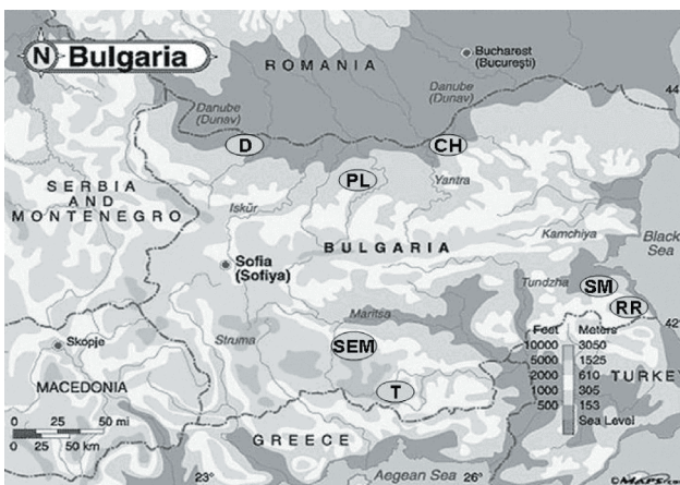
Fig. 1: Location of wild Vitis populations in the physical map of Bulgaria. The circles indicate the location of the wild populations analyzed.

Genetic diversity analyses: For the calculation of allele frequencies, expected ( H_e ) and observed ( H_o ) heterozygosity, probability of identity ( PI ) and probability of null alleles, the software GENALEX (PEAKALL and SMOUSE 2006) was used. Genetic distances between grapevine genotypes were calculated as [-\ln(\text{proportion shared alleles})] using Microsat (MINCH et al. 1997). The obtained data was used for the construction of a dendrogram using the programs KITSCH from the PHYLIP package software (FELSENSTEIN 1989) and Treeview (PAGE 1996).