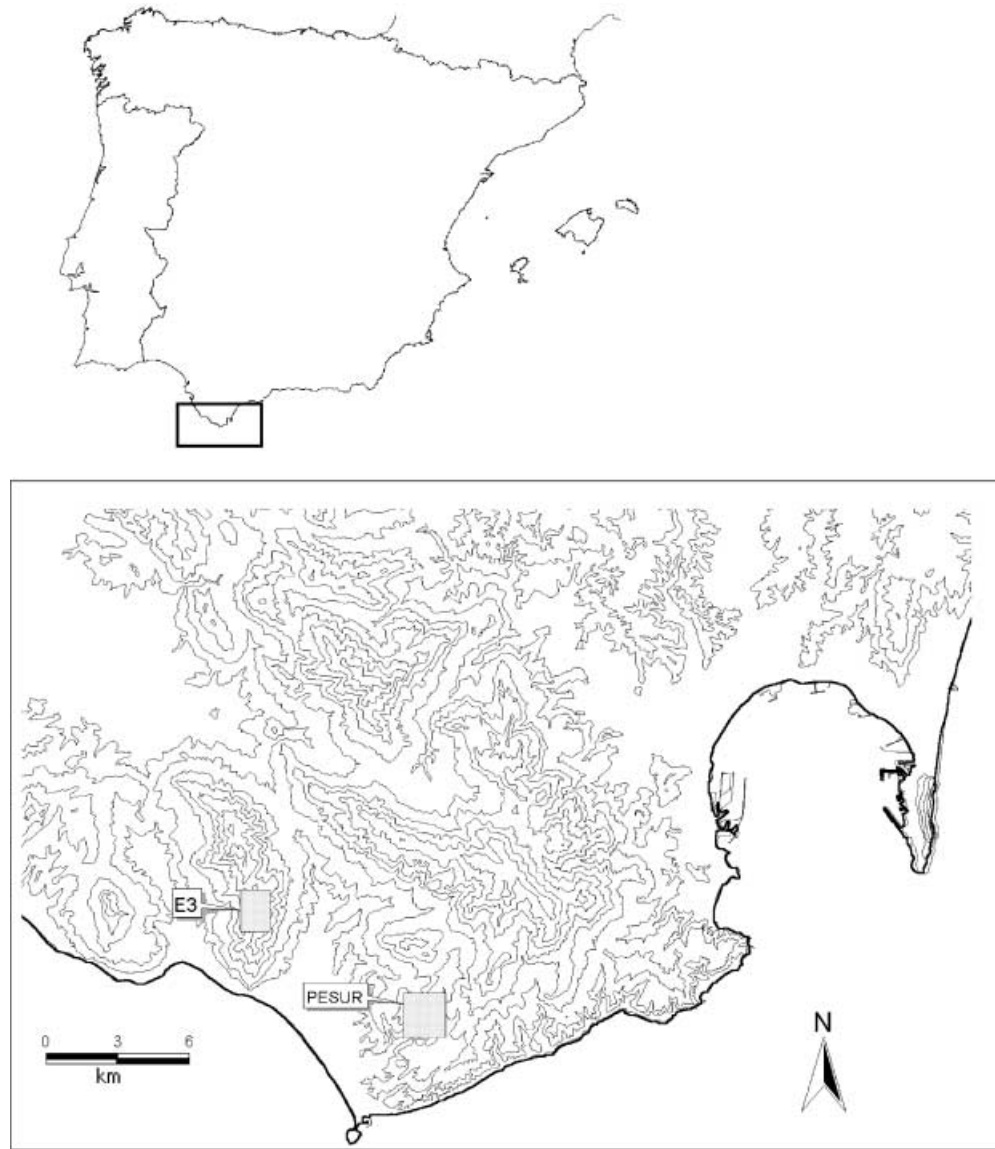
Fig. 1. Location of the Campo de Gibraltar region in the Iberian peninsula, and the study areas on a map showing 100-m altitude contours.