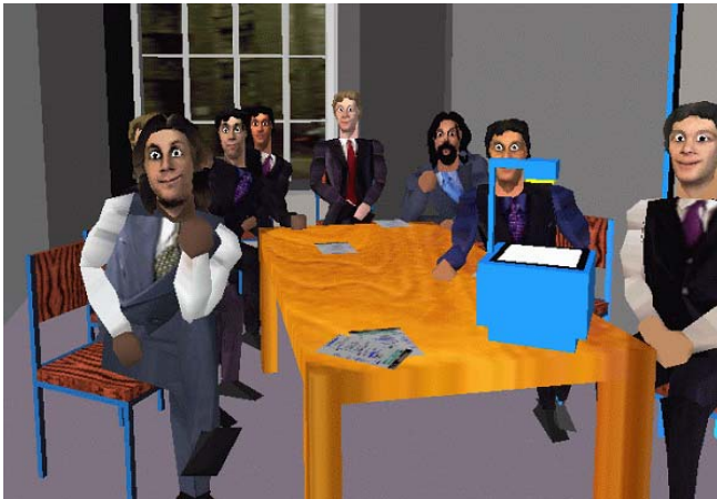
Figure 5a | A snapshot of the positive audience