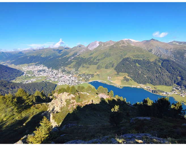
FIGURE 3 Meeting location of the World Biodiversity Forum 2022 in Davos, Switzerland. Left: Local biodiversity of an alpine pasture. Right: Landscape heterogeneity and diversity of ecosystem types.