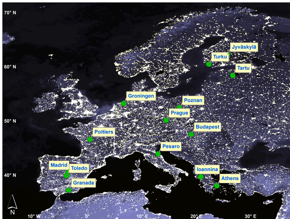
Fig. 1. The fifteen European cities focused on this study. The background layer represents the artificial light at night (ALAN) for Europe. The image was produced by mosaicking Defense Meteorological Satellite Program (DMSP) Operational Linescan System (OLS) satellite images.

area > 50%, building density > 10/ha and residential human density > 10/ha) followed Marzluff et al. (2001), and it has been used in previous studies of urban avian ecology (Clergeau et al., 2006; Loss et al., 2009; Møller et al., 2015; Morelli et al., 2016). Around each point count, we described the vegetation cover within a distance of 50 m from the observer (Díaz et al., 2013). The total vegetation or green cover was evaluated by considering grass, bushes (including plants from gardens), and trees (isolated trees, tree lines and patches). Considering that green cover was negatively and significantly correlated with built cover ( r^2 = -0.75 , p < 0.001 ), we decided to use only green cover in further analyses, avoiding redundancy. Additionally, we estimated the Shannon diversity index on the proportion of three components of urban green (grass, bushes and trees) around each point count as a metric of green heterogeneity.