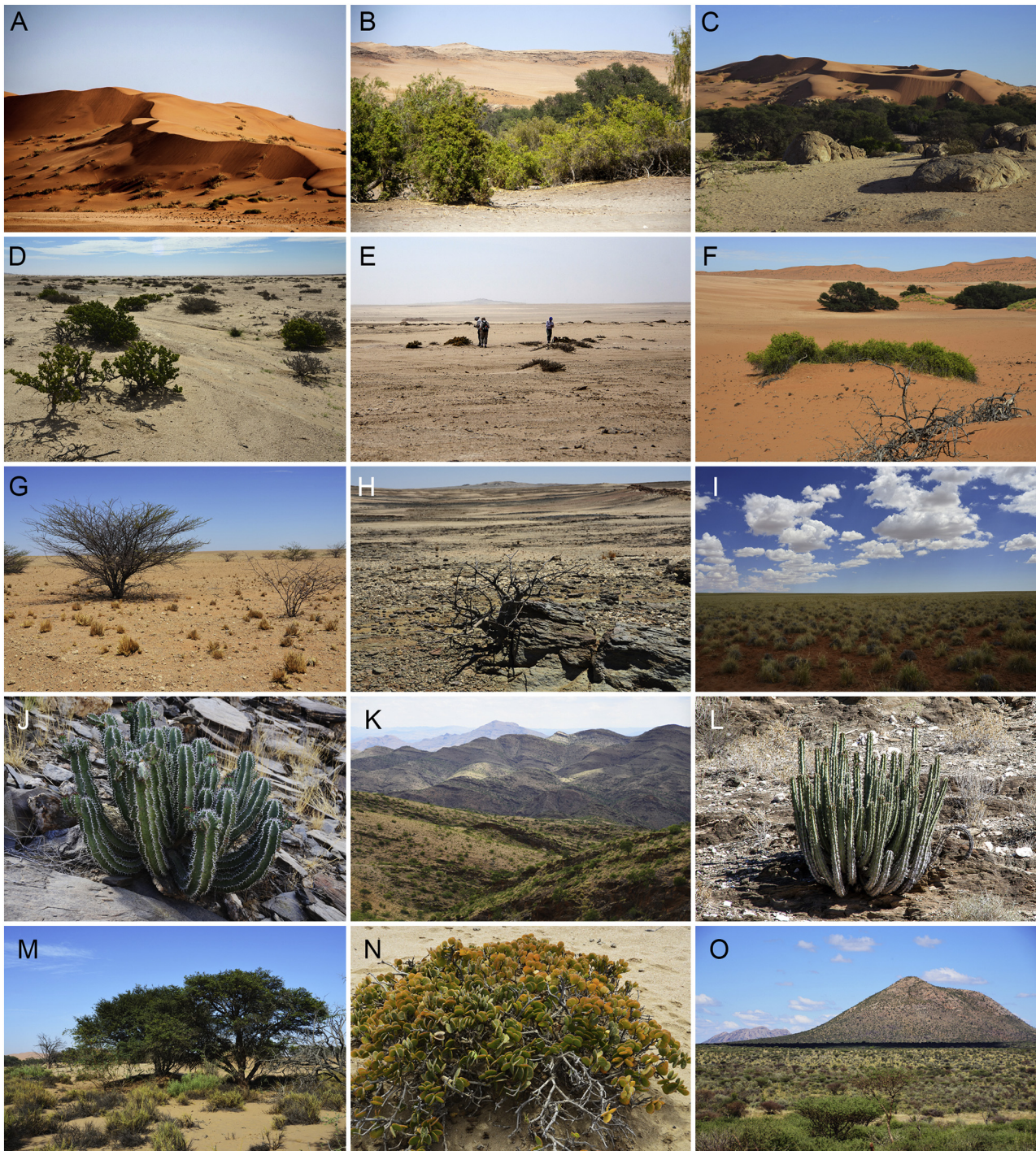
Fig. 2. A–O Landscapes and some vegetation types of the Namib desert and bordering areas. A, F. Dunes at Gobabeb. B, C. Dunes with trees such as Acacia erioloba , and Faidherbia albida marking the course of the dry Kuiseb river-bed. G. gravel plane near Zebra Pan. D, E, H. The rocky gravel planes. I. Grasses on the plateau. J–L. Euphorbia spp. among the rocks in the nearby mountains. M. Vachellia reficiens and shrubs stabilizing the dunes. N. Detail of Zygophyllum stapfii – an endemic shrub to the Namib desert. O. Transition areas toward the savanna vegetation.