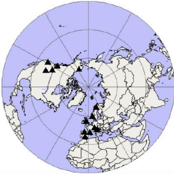
767 768 Figure 1. The locations of the 13 regions identified in Table 1 shown on an azimuthal 769 equidistant projection.