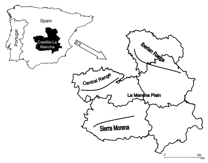
Figure 1. The Castilla-La Mancha region of central Spain showing the positions of the La Mancha Plain and the main mountain ranges and the boundaries of the five provinces.