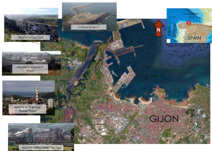
Figure 1: Left) Gijón city on the Cantabrian coast and location of samples (red

The coastal area of Gijón (Northern Spain) is one example of a polluted area related with coal handling. Gijón city is surrounded (Figure 1) by a coal power plant, a coal park, a cement industry using coal as a fuel, a steel industry with coke plants, and the activities developed at the El Musel, a commercial seaport that manages about 7 million tons of coal and coke per year (Port Authority of Gijón 2018). These industrial activities are among others, the source of carbonaceous dust storms affecting the city and the coast.