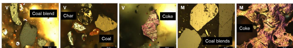
Figure 2: Images of the anthropogenic organic particles in V and M samples. Optical microscopy. Long side of the images: ~200 µm

San Lorenzo Beach : Coal is the main component of the organic fraction, ranging from 90% to 100%, followed by coke particles (0.0-14%) and chars (from traces to 6.0%). The dominant organic particle size is between 0.5-2.0 mm. However, in some areas of the beach rounded fragments of coals (M14 sample) of higher size are also found ( \varnothing : ~2-4 cm) which is probably linked to a greater influence of tides and waves.