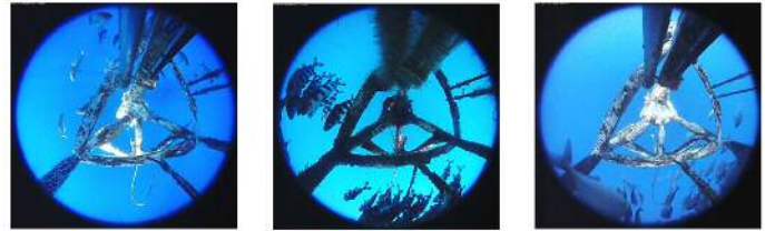
Fig. 2. Pictures taken by the fisheye IP camera attached to the oceanographic buoy showing schools of rudderfish ( Centrolophus niger , left and right) and pilot fishes ( Naucrates doctor , center).

of the EMODNET (http://www.emodnet-physics.eu/portal/) and COPERNICUS (http://marine.copernicus.eu/). These networks are of public access and make available in-situ information for modelling hindcast and forecast providing a social service regarding e.g. the marine weather conditions or the expected circulation pathways in case of environmental emergencies, related to the field of operational oceanography.