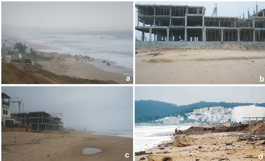
Fig. 3. Last stages of a storm approaching from the East which stroke the studied littoral at the end of May 2006. Swash processes affected summerhouses at Almina (a), buildings under construction and residential area located between Ksar al Rimal and Kabila (b and c) and backshore at M'Diq village (d) where leisure facilities and a promenade are under construction