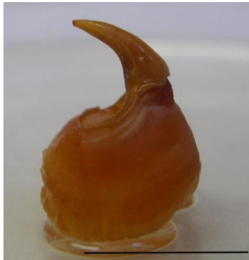
Fig. 2. Shape of a hook removed from arms pair IV. Bar scale correspond to 1 cm.