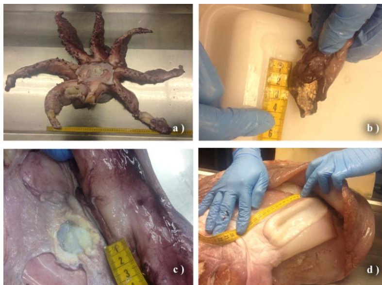
Fig. 1. (a) Brachial crown of Taningia danae . (b) Light organ on arm tip II. (c) Pore between arm pairs III and IV. (d) Funnel cartilag

indicating that the specimen was probably a mature female. Implanted spermatangia in the mantle and other body surfaces of T. danae have often been reported associated with male-inflicted wounds, probably made by males using their beak or arm hooks (Hoving et al. 2010). We also observed incisions close to the area of embedded spermatangia, supporting this hypothesis.