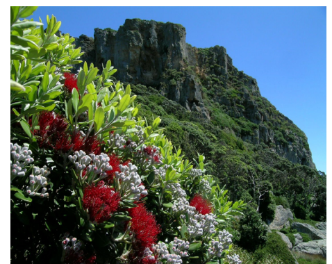
Figure 1: Example from Tawhiti Rahi Island of the Poor Knights Islands (Wilmshurst et al. 2014). Pollen data shows that the current vegetation composition is completely different from ancient ecosystems.