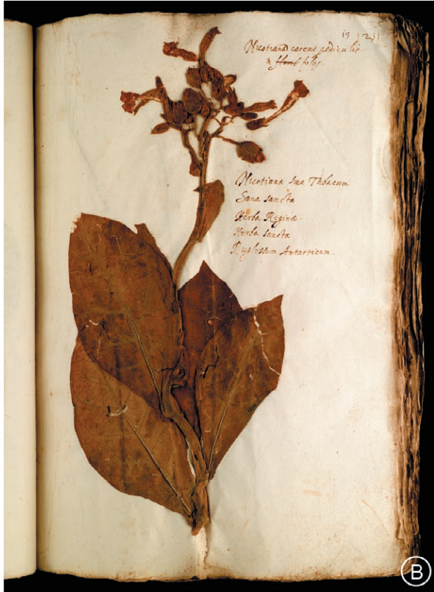
Figure 3. Herbarium Aldrovandi (A) A perfectly preserved specimen of Orchis simia Lam. (Vol. 4, fol. 105), collected around Bologna, probably in 1552 (Soldano 2001); (B) Nicotiana tabacum L. (Vol. 14, fol. 13), one of the oldest extant specimens of this species. The plant (or, possibly, the seed from which it was grown) was delivered to Aldrovandi by a correspondent from Rome in 1567 (see Soldano 2004).

Stored at the Muséum National d'Histoire Naturelle, Paris, France (Herbarium P).