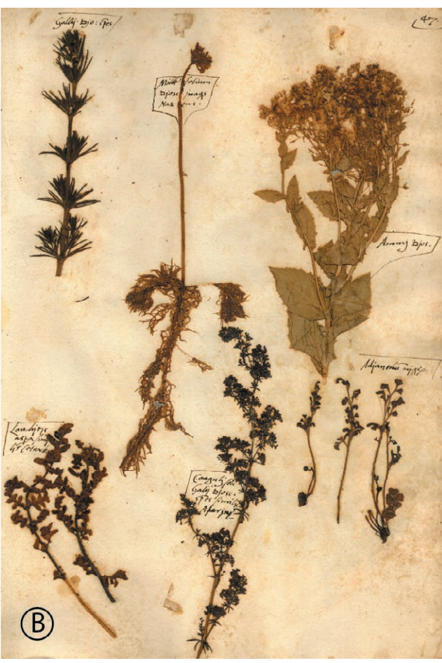
Figure 1. Herbarium "Anonimo Toscano" (A) The anonymous author appears to be very keen to use the space on each page efficiently. Many samples consist of a single leaf, occasionally misidentified, as in the case of the leaf of Acer opalus subsp. obtusatum (Waldst. & Kit.) Gams, named here "Folium Anemones candidae Diosch."; (B) The collection includes relatively uncommon species, like Notholaena marantae (L.) Desv. (here named "Lonchitis aspera similis Cetrach"), or rare, like Hottonia palustris L. ("Millefolium Diosc. in aquis nascens").

Relevant references: Saint-Lager (1885); Soldano (2000, 2001, 2002, 2003, 2004, 2005).