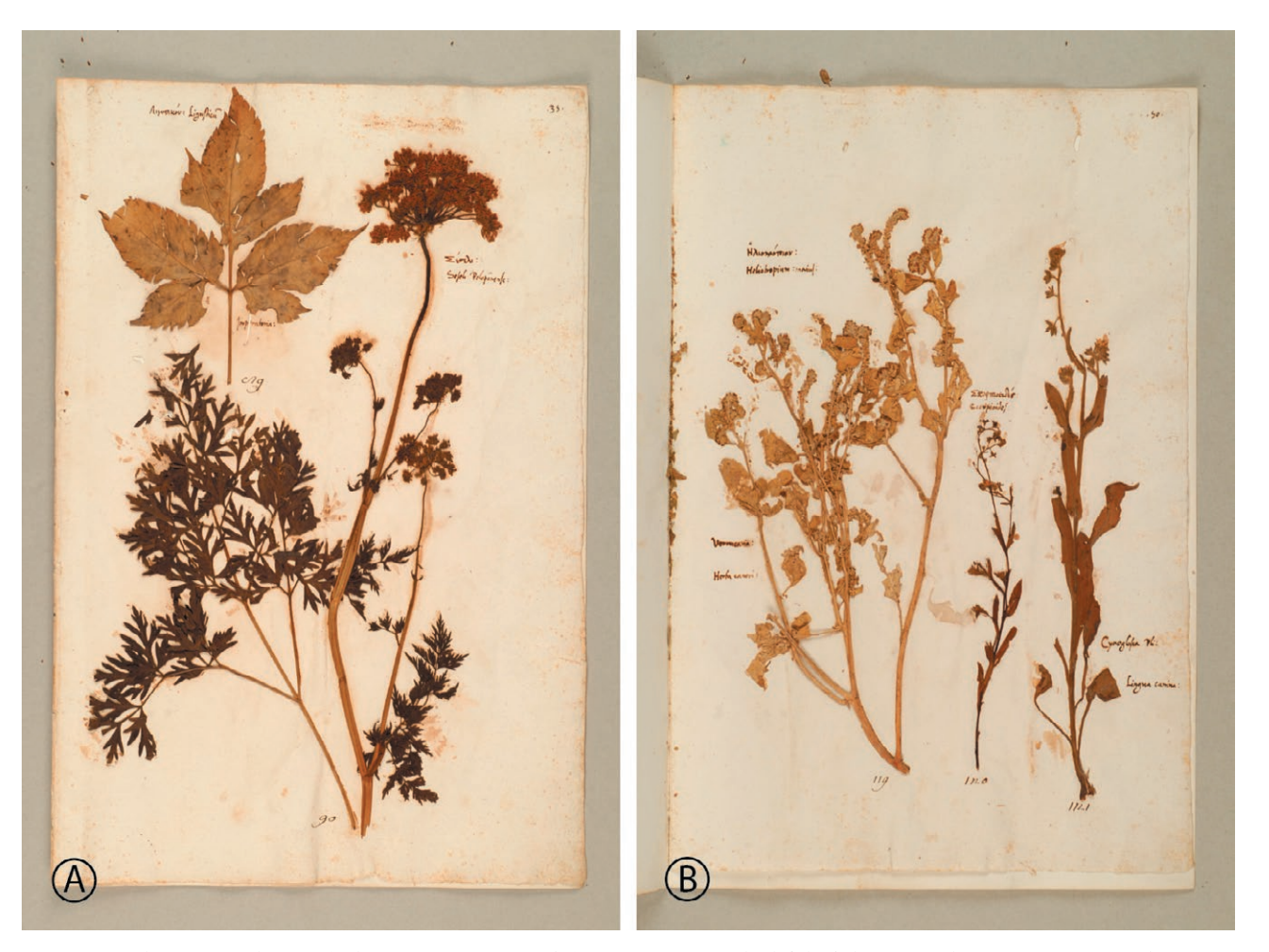
Figure 5. Herbarium Cesalpino (A) Sheet n. 35. N. 90: Seseli (Apiaceae), except the left leaf above; (B) Sheet n. 50. N. 119: Heliotropium europaeum, N. 120: Myosotis scorpioides, N: 121: Cynoglossum creticum (Boraginaceae).