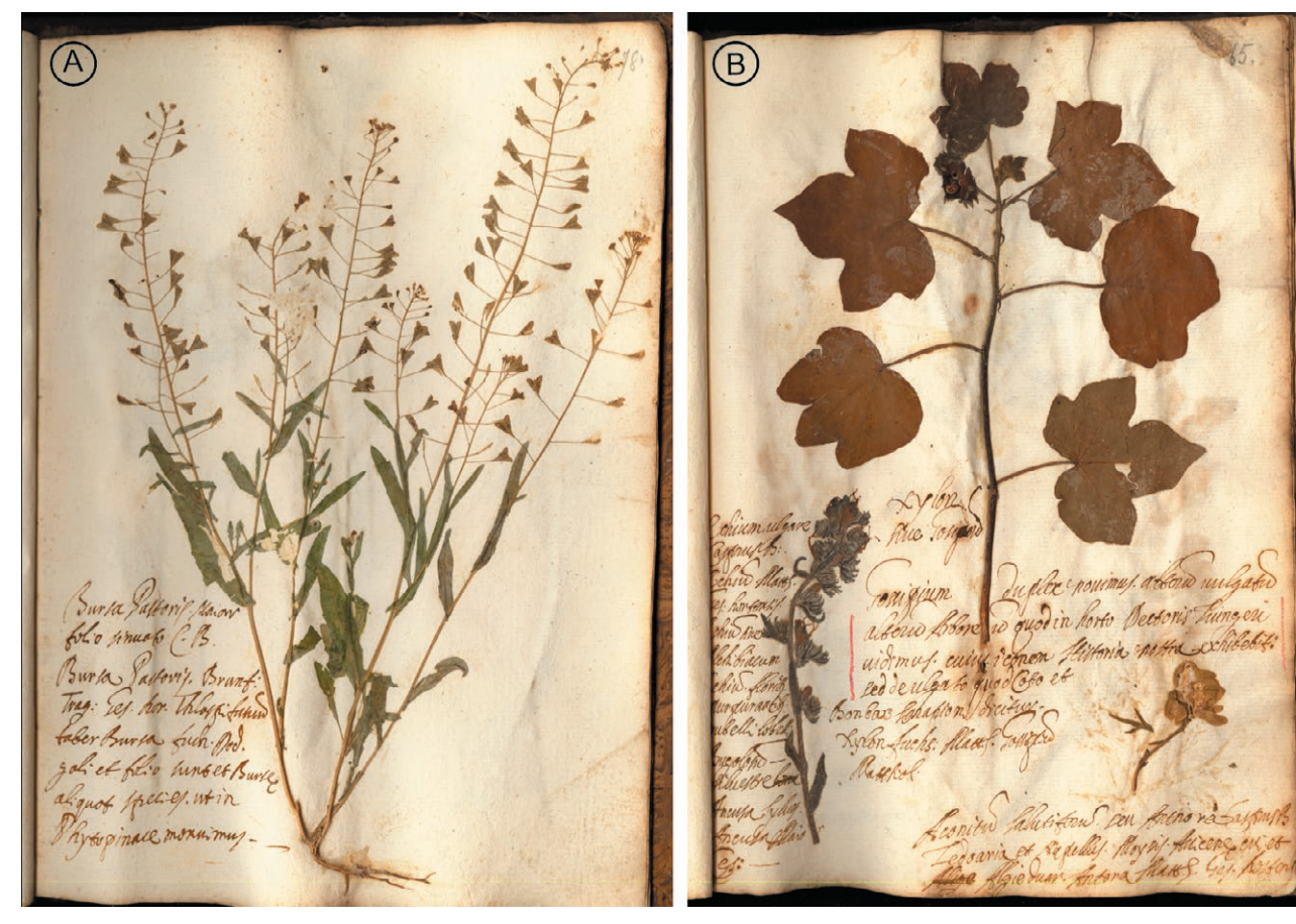
Figure 7. Herbarium "Bauhin at Bologna" (A) Capsella bursa-pastoris L. The concise discussion about the species variability ends with the words "... ut in Phytopinace monuimus", that indicate Caspar Bauhin as the author. (B) Gossypium herbaceum L. The handwritten comment includes the words: "...quod in horto doctoris Zwinger vidimus - cuius iconem Historia nostra exhibebit". In fact, in the first volume of J. Bauhin's posthumous Historia plantarum (Bauhin and Cherler 1650) we find a description of this species, with reference to the garden of Doctor Zwinger in Basel.

Format and extent: One volume of 149 pages, containing 181 specimens.