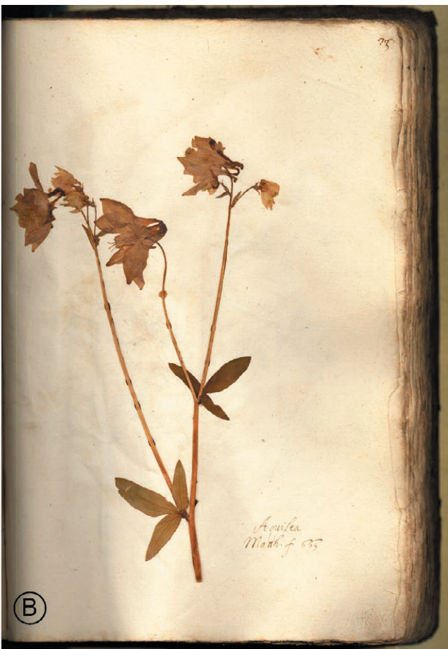
Figure 6. Herbarium "Aldrovandi's School" (A) Agrimonia eupatoria L. The handwritten reference is: "Matthioli 1068", the page number corresponding to the species description in the 1568 edition of Mattioli's Dioscorides. (B) Aquilegia cf. atrata Koch. This species, named here "Aquilea Matth f. 665", is depicted in a full-page table in Mattioli (1568: 665).

Format and extent: originally in one bound volume of 266 pages (disbound in 2007), with 768 specimens. The specimens are ordered following the system later published by the author himself (Cesalpino 1583).