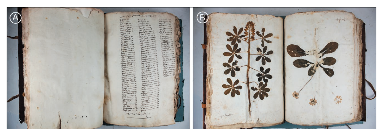
Figure 4. (A) Herbarium Mendoza: list of plant names signed below by Diego Hurtado De Mendoza; (B) two sheets: Lupinus sp. (left), Bellis sp. (right). Mesa 25-I-11.