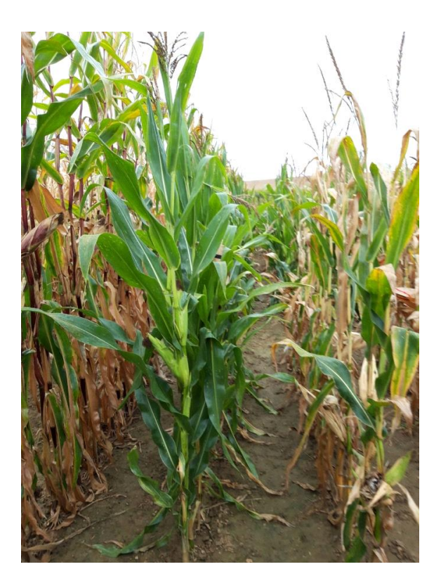
Figure 2. Comparison of different delay of senescence phenotypes of maize planted in a nursery (Baden-Württemberg, Germany).

However, to assess whether the SG is functional or not it is important to measure the CO_2 interchange intensity which is slow and laborious and is particularly limiting when many genotypes are evaluated as is common in crop breeding. For that reason, the visual SG has been improved in crop breeding, for example, in private maize [18,19] but it is unknown if it is cosmetic or functional.