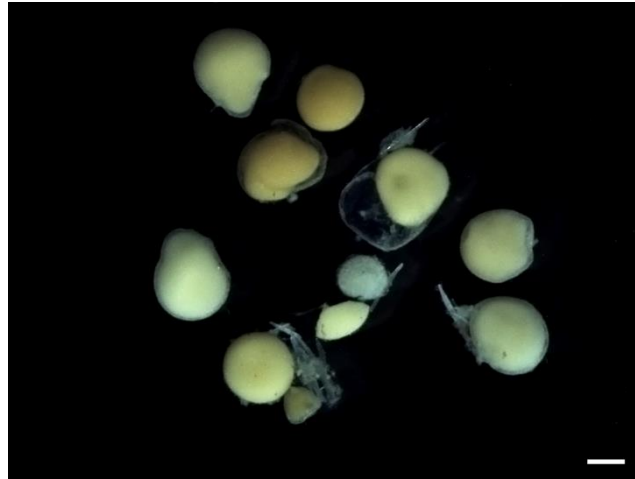
Figure 3: Oocytes of the species Acanella arbuscula , encountered in the water column and/or attached to mucus nets released by colonies during maintenance in aquaria. Scale bar: 60 \mu\text{m}

To our knowledge, this is the first record of a polyp bail-out response in cold-water octocoral species. Similar responses such as fragment detachment (Dahan and Benayahu, 1997) and pinnitomy (Gohar, 1940), have been recorded in shallow octocoral species, however both studies report these as frequent phenomena and modes of asexual reproduction rather than stress induced responses. The existence of polyp bail-out in the two cold-water alcyonacean species described herein suggest that this behaviour might be more common than previously thought among coral species. Moreover, the transformation of sessile adult stages into ball-like forms in A. arbuscula can be considered a form of reverse development, highlighting the existence of such developmental pathways not only in scleractinian but also in octocoral species. However, it is unclear if these traits are also shared with deep-water scleractinian and shallow-water octocoral species. As unravelling the evolutionary relationships of classes within the phylum Cnidaria has been challenging (McFadden et al., 2006; Zapata et al., 2015, Kayal et al., 2018), further studies are needed to clarify the origin