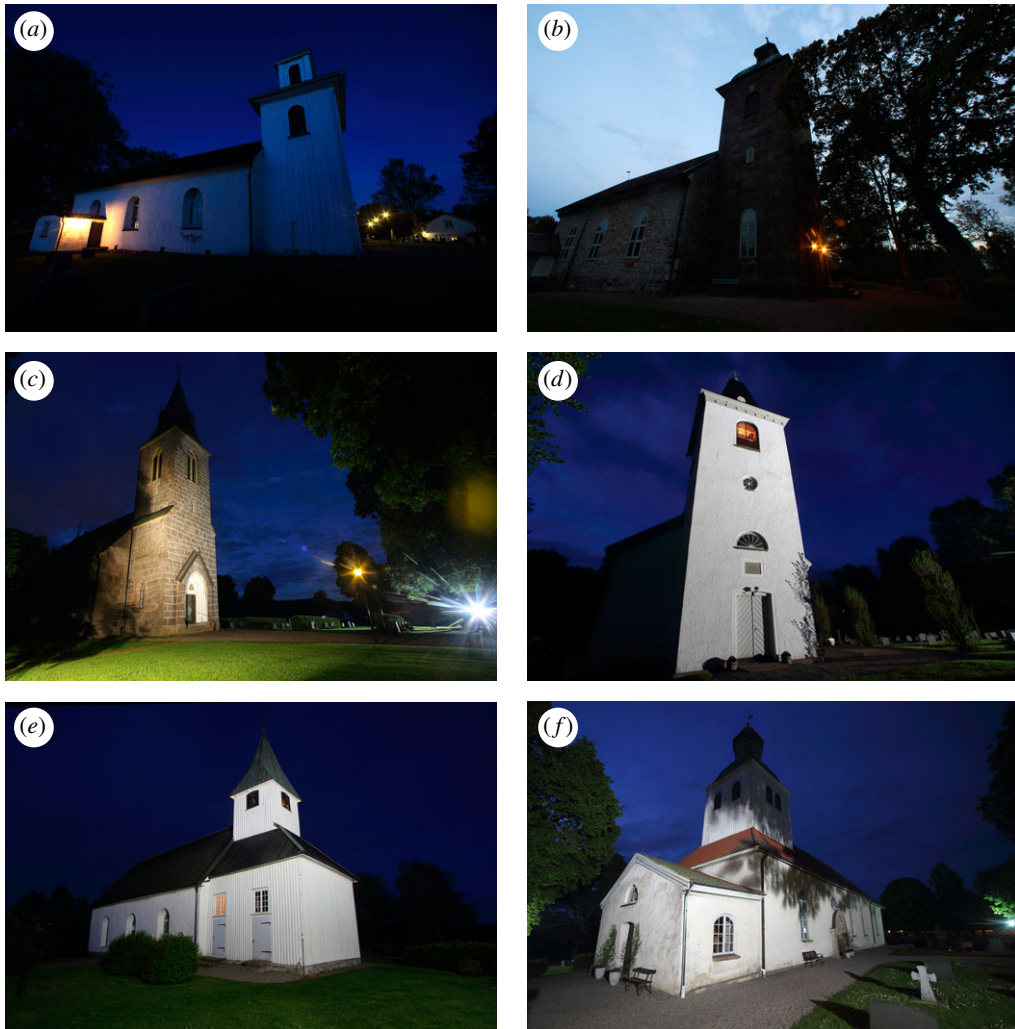
Figure 1. Examples of the three categories of flood-lighting used on the churches examined during this survey; (a,b) not lit, (c,d) partly lit, (e,f) fully lit. All churches shown harboured colonies of long-eared bats in the 1980s. In 2016 the colonies were gone from (d) and (e) but remained in (a–c) and (f).

the outside. In all cases the emerging bats were unambiguously recognized as Plecotus because their diagnostic long ears could be seen.