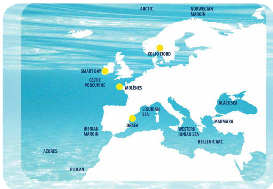
Figure 1. Map of current EMSO nodes. Yellow dots indicate testbeds.

Turkey, Germany, and the Netherlands. Participation is open to all (both individual scientists and institutions), and will be coordinated through an association called ESONET-Vi (European Seafloor Observatory Network—The Vision), following the extensive scientific community planning